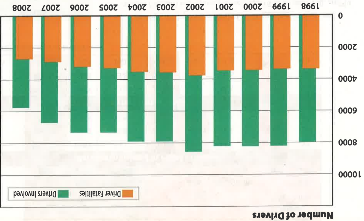
Graph Driver Fatalities and Drivers Involved in Fatal Crashes Among 15- to 20-Year Old Drivers, 1998-2008