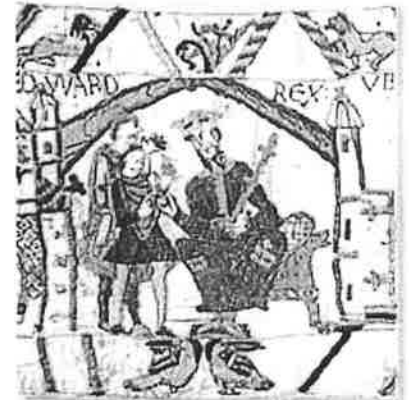
King Edward sends Harold on a mission

Pursuing his mission, the Tapestry describes how Harold crosses the English Channel to Normandy, is held hostage by a Norman count and is finally rescued by William.