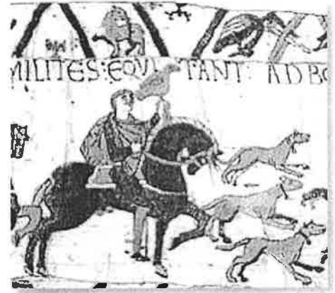
Harold Godwinson From the Bayeux Tapestry

Across the English Channel, William, Duke of Normandy, also laid claim to the English throne. William justified his claim through his blood relationship with Edward (they were distant cousins) and by stating that some years earlier, Edward had designated him as his successor. To compound the issue, William asserted that the message in which Edward anointed him as the next King of England had been carried to him in 1064 by none other than Harold himself. In addition, (according to William) Harold had sworn on the relics of a martyred saint that he would support William's right to the throne. From William's perspective, when Harold donned the Crown he not only defied the wishes of Edward but had violated a sacred oath. He immediately prepared to invade England and destroy the upstart Harold. Harold's violation of his sacred oath enabled William to secure the support of the Pope who promptly excommunicated Harold, consigning him and his supporters to an eternity in Hell.